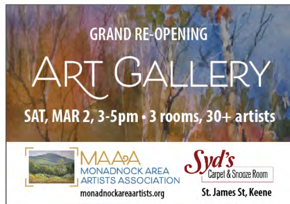
Mockup of a newspaper ad for the program