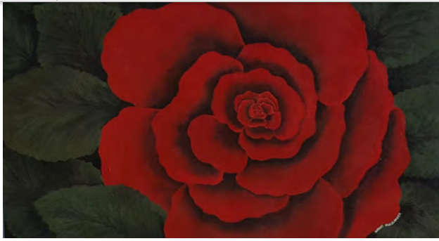
Wendi Hulslander's acrylic painting will be in the LOVE series